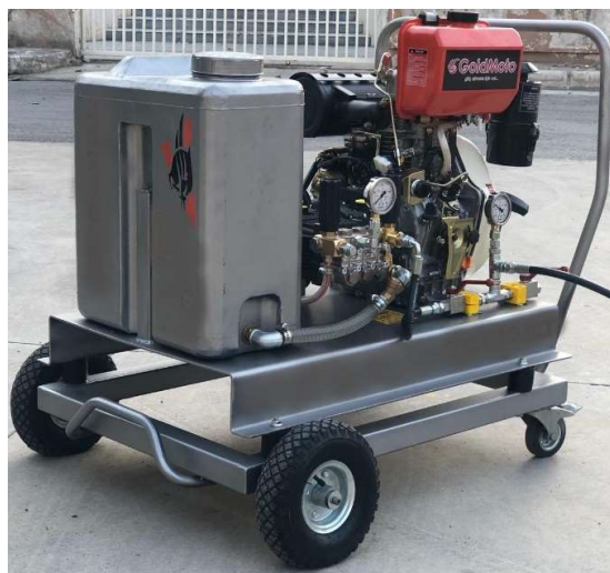
Diesel engine-driven low flow pump (15 l/min.)