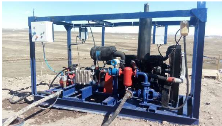
Diesel engine-driven high pressure high flow pump (back view)