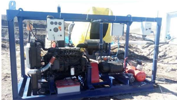
Diesel engine-driven high pressure high flow pump (front view)

We can supply triplex pressure pumps in various flow and pressure rating with electric motor or diesel engine. These pumps generates minimum 100 bar pressure. Higher pressure pumps are available for different applications.