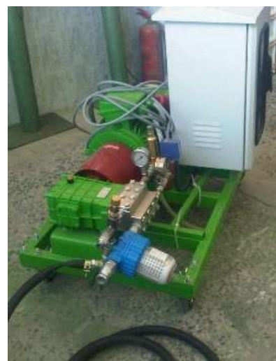
Electric motor-driven pump